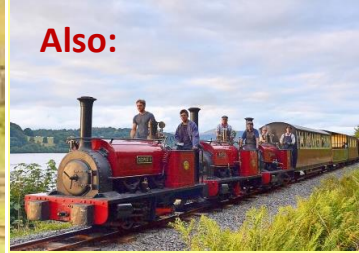
Full size narrow-gauge steam

Over thirty layouts 'T' to 'O' gauge with emphasis on narrow-gauge railways also featuring the iconic 'Forth Railway Bridge' in 'T' gauge Trade Support · Refreshments · Free Parking Saturday & Sunday 10am - 5pm Monday 10am - 3:30pm Adults £5.00 Family (2+2) £10.00