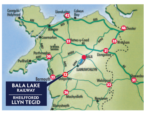
Distance (miles) to Bala Lake Railway